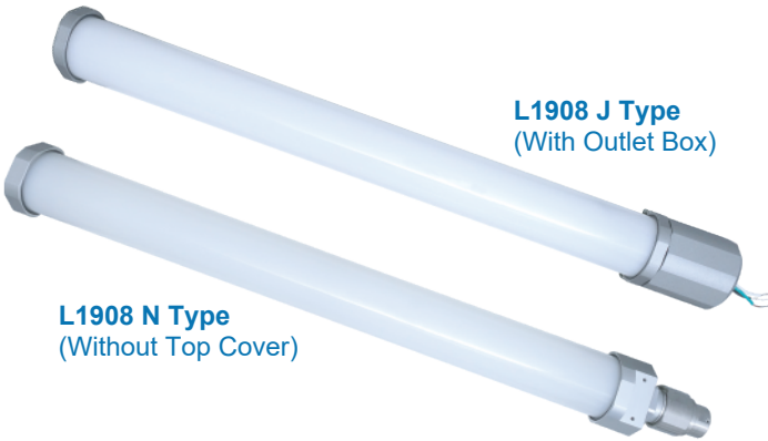
L1908 J Type (With Outlet Box)